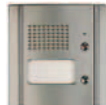
Unifone front door station

Your Unifone can also be used as an intercom system. Room to room calling allows you to use your handset to dial another specific handset in your home and talk to someone in another room. You can also monitor a room, for instance, where your children are playing, by dialling the handset in that room and listening in. The Unifone also operates as a hands-free paging unit. You can even answer your front door or gate by activating the Unifone front door station (if fitted) from any extension throughout your home.