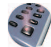
8 fixed function keys for both mute and hands free.

Telephone systems have long been the domain of corporate and business users. Advanced features like access to multiple lines, conference calling, and music on hold can be difficult to use and are typically associated with expensive telephone systems. The Unifone, an Australian-designed and award winning telephone system makes these corporate-style features available to you.