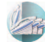
Adjustable stand and wall mount allows the flexibility to use in any location