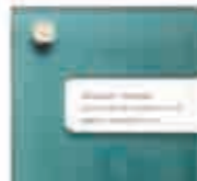
Australian Design Award

As a 2003 winner of the Australian Design Awards, the Unifone has been designed to be practical in the way it looks and how you use it.