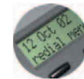
Crisp LCD display with context-sensitive menu keys