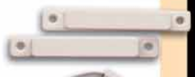
Hardwired Door Reeds