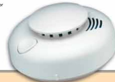
Hardwired Smoke Detector