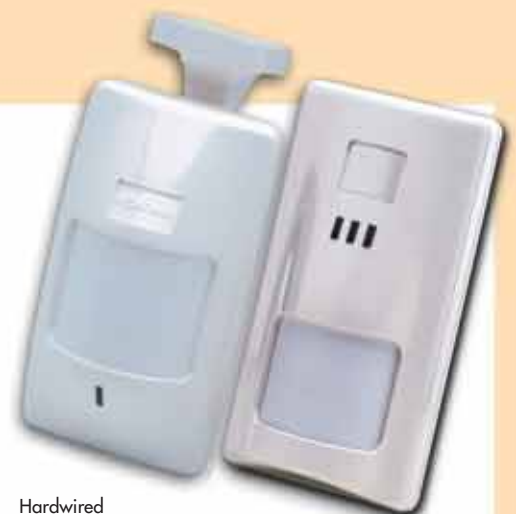
Hardwired Motion Sensors