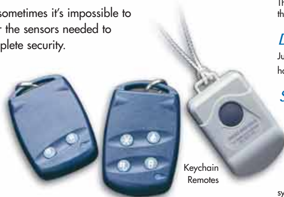
Wireless Smoke Detector