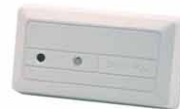
Hardwired Glass Break/ Shock Sensor