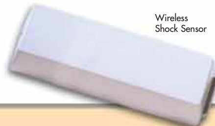
Wireless Shock Sensor

For large glassed areas eg. shop front, a shock sensor can be used to detect vibrations, notifying the security system if someone has forced or broken the window.